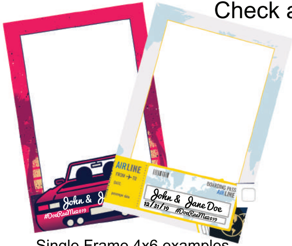
Single Frame 4x6 examples