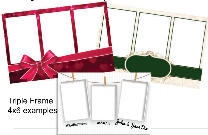
Triple Frame 4x6 examples